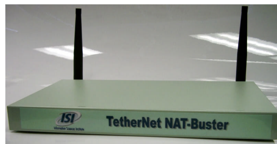
Figure 1 TetherNet box (11”x6”x1”)

TetherNet solves this problem much as any competent network engineer would – by tunneling traffic back to a real Internet access point. TetherNet combines a thorough tunnel configuration together with remote automation, making setting up a remote network as easy as using a NAT box.