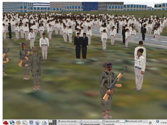
Figure 2 3D Rendered display from a SAF

A few workstations on a local area network (LAN) can support simulations of a few thousand entities in a typical JSAF run. For this size simulation, a simple broadcast of all data to all nodes is sufficient. Each node discards data that is not of interest to it. The Run Time Infrastructure (RTI) controls this activity. When the simulation is extended to tens of thousands of entities and scores of workstations, broadcast is not sufficient. UDP multicast has proven to be a good solution to this issue, in lieu of the simple broadcast. In this case, each simulator receives only the data to which it has subscribed, i.e. in which it has a stated interest. This leaves enough compute capacity for data management and visualization, e.g. a three dimensional, rendered view of the urban area, shown in Figure 2.