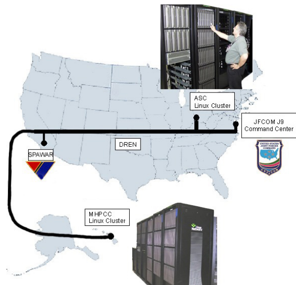
Figure 3 Notional JFCOM Net Map

Communications between the sites are provided by the Defense Research and Engineering Network (DREN). Experiments for Urban Resolve have been both unclassified and classified. The work that has been undertaken for CENTCOM also requires encryption of the communications’ links. The Linux operating system is common across the net (usually Fedora, but also Red Hat Enterprise) and most of the programs are written in C++, with a smattering of Java.