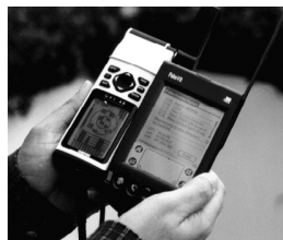
Figure 1: A Palm VII PDA with GPS receiver

Our agents help coordinate the everyday activities of a research project: they keep the project running smoothly, rescheduling meetings when someone is delayed, ordering food for meetings or if someone has to work late, and identifying speakers for research meetings. Each person in the project is assigned his or her own personal proxy agent, which represents that person to the agent system.